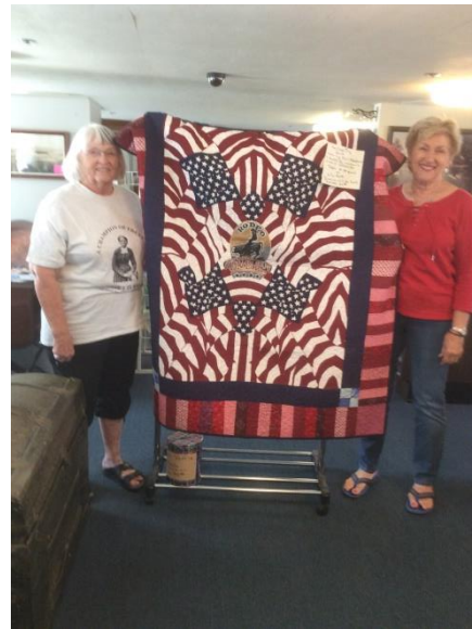
Quilt donated to Lakeside Historical Society for a raffle in October for Heritage Day